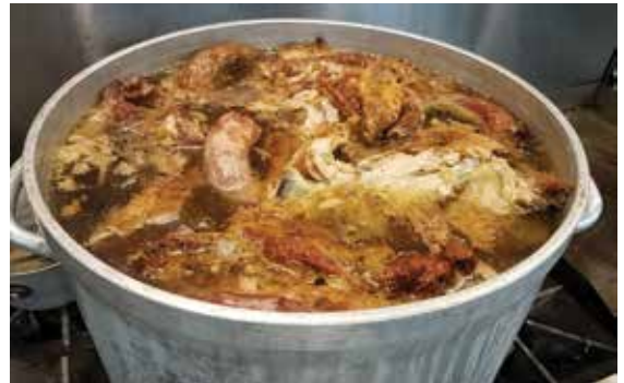
Thank you to the Executive Chef at Maranatha Bible & Missionary Conference for donating his time, talent and kitchen space to cook and prepare nearly 200 turkeys. With over 80 men, 20 single mothers and over 20 children in our nearly full shelters, this was an incredible blessing.

THANK YOU FOR YOUR GIFT AND YOUR IMPACT.