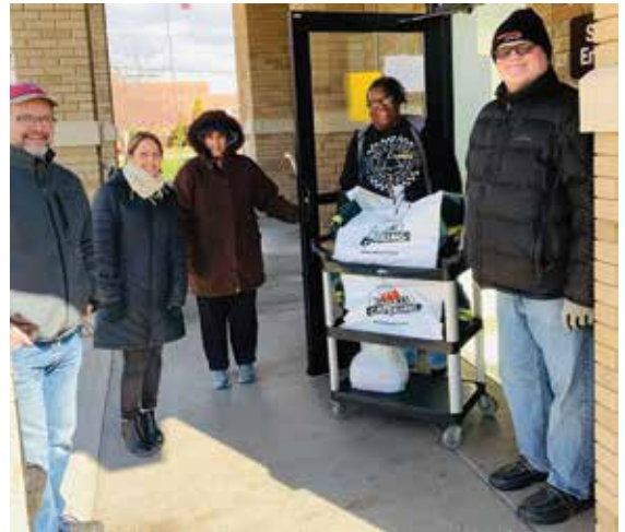
Thankful for our devoted volunteers who prayed around our buildings, cooked meals at home and delivered them to our shelter.