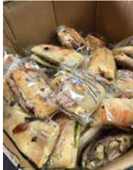
Thank you Harvey St. Starbucks for thinking about us and donating milk and pre-made sandwiches.